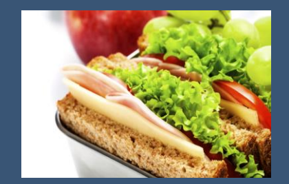
BOXED LUNCHES >